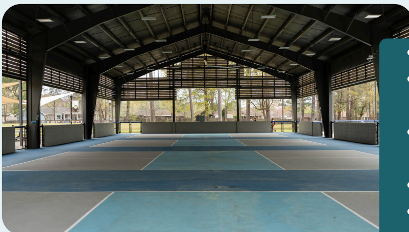
Casey Pavilion – Pickleball